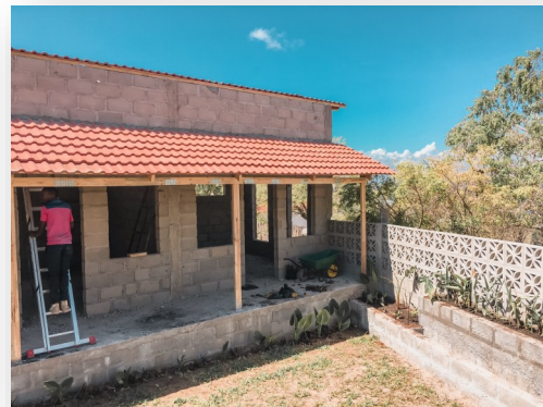
Nacala Women's Centre coming along well, now has walls and roof